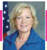
State Sen. Lisa Boscola 18th Senate District